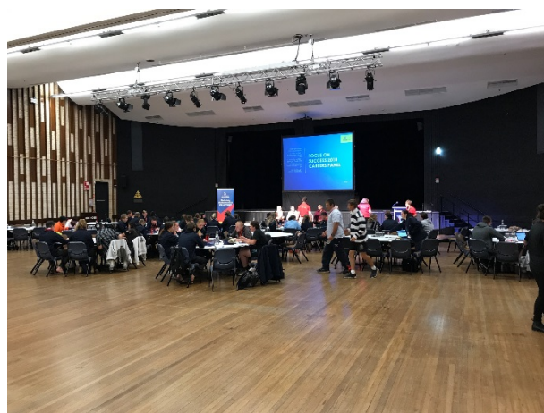
Figure 8: One of the workshops for digital storytelling

The theme for the 2018 workshop was 'ASPIRing for my/our future' with around 50 Year 11 students and nine teachers from seven high and central schools travelling to Dubbo. Two of the four days focused on Digital Storytelling with instruction and support provided through an independent and not for profit organisation ( www.digitalstorytellers.com.au/ ). The first session included guidance on planning, filming and creating a digital story with prompts to guide students. Students worked in pairs using ASPIRE iPads or their own phones, and were given time to create their stories ready for editing the following day. The free version of Kinemaster™ app was used for editing, with the Digital Storytelling team providing explicit instruction, advice and support as students edited and finalised their digital story. Links to copyright free resources (for example, images, music) were also provided. By the end of the second session, students uploaded their completed digital stories to an online repository and were invited to write their names on a whiteboard if they were willing to show their video at the celebratory event at the end of the day.