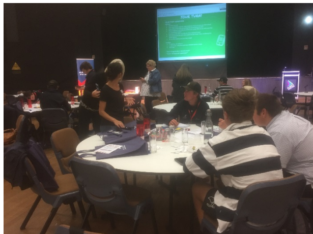
Figure 9: Hard at work in the workshop

A total of 36 consent forms were returned. Twenty-six digital stories were collected (all having written consent) and interview data was collected from 15 students for whom written parental consent had been given. A focus group with eight teachers was completed. Interviewees were all given the option to receive a copy of the transcript before analysis commenced. The approach to interviewing was designed to be unobtrusive and very informal, given that the two researchers conducting the interviews were not known to the students as well as the potential vulnerability and power relationships that