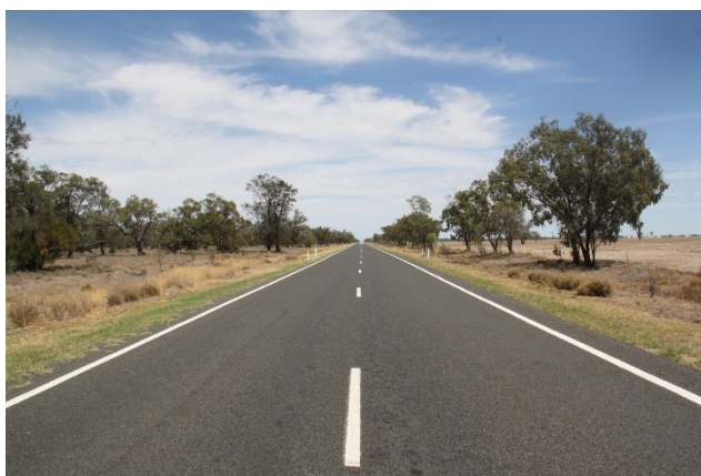
Figure 4: The dry and parched land throughout rural areas in Australia

This section will begin by providing a summary overview of the literature related to the educational barriers experienced by students from regional and remote areas. There are numerous interrelated factors which impact the learning and educational opportunities of regional and remote youth. These factors are underpinned by the multiple disadvantages which are found in rural, regional and remote areas (Halsey, 2017). Many students from these areas fall under multiple equity categories such as being from a low SES background, being Indigenous, being first in their family to attend university, and having a disability (Cardak et al., 2017; Nelson et al., 2017; Pollard, 2018). These levels of disadvantage have a compounding impact on learning and opportunity (Nelson et al., 2017; Pollard, 2018) and the main issues are analysed in the sections that immediately follow. The review will then focus specifically on the rural student transition to university in order to provide context for the choices in research design that are detailed in the next section.