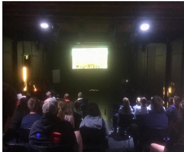
Figure 10: The screening of the stories

For the ASPIRE workshop: as a school-based project, the digital story workshops provided useful skills for all learners in writing and scripting, editing, picture composition and also sound production. While we utilised an application called Kinemaster™, a number of free apps exist and these short videos can also be created via mobile phone technology. This is a versatile and accessible way to produce validating and important visual artefacts. These skills can be used not only in educational contexts but also, to tell stories relevant to the community and the region. Having skills in digital storytelling offers individuals the opportunity to record significant events or provide historical documentation that is relevant to the location and context. Digital storytelling has also been described as a cathartic and embodied experience for participants (Wilcox et al., 2013) as individuals report how telling their own stories is both validating and experientially rich. We hoped that the participants in this project had equally validating experiences.