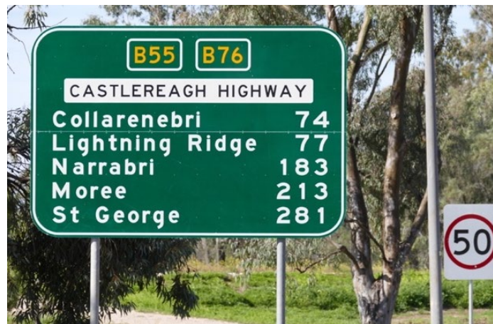
Figure 1: The distances involved in travelling

This recognition would include understanding that this is not a group without aspirations or goals but rather a cohort that may simply require additional recognition and support in realising these ambitions. Such recognition also needs to consider the nuances of this rural and remote lived experience rather than collective or mythic constructions of these environments.