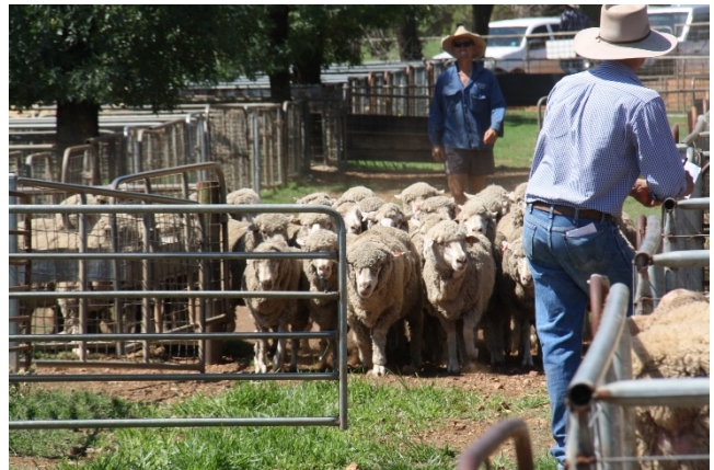
Figure 6: Farm working life

Once a decision to study is made, the transition to higher education for regional and remote students becomes even more challenging as it involves moving away from home, family, friends, and the support and familiarity of those things. Students who relocate to take up further study face logistical, financial and emotional challenges such as transport logistics, finding suitable accommodation, accessing allowances and financial support, and the seeking of part-time work (Burke et al., 2017; Halsey, 2017; Gore et al., 2015).