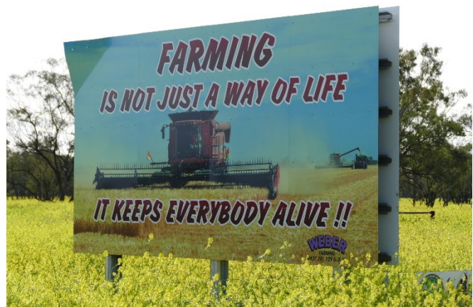
Figure 5: Rural billboard

Parental encouragement towards further study stimulates regional and remote youth to apply for university (Halsey, 2017), but this is dependent on the child's academic ability and parents' own educational and occupational backgrounds (Koshy, Dockery, & Seymour, 2017). Conversely, regional and remote youth may be disadvantaged towards aspiring for further study when they grow up in a non-traditional family setting and their parental expectation is low (Byun et al., 2012). This is part of the "web of disadvantage" that these learners encounter (Halsey, 2017) and is exemplified in a lower proportion of students from low SES backgrounds intending to attend university than their high SES counterparts (Gore et al., 2015). Similarly, a belief in the community that university doesn't offer a rewarding career (Halsey, 2017) can hinder the aspirations of youth to attend university. For those that do aspire to further education, the issue is that they have to "go away" for employment and a career to take up such opportunities.