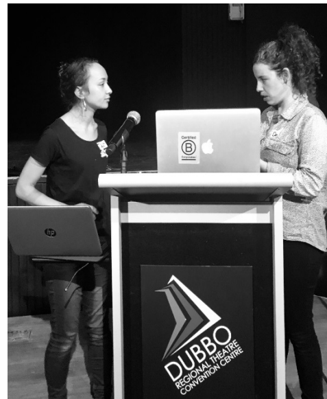
Figure 3: Conducting the Digital Story workshop

Our intention was to explore this issue from a diversity of perspectives and importantly to centre the study on those best positioned to reflect upon the issues and considerations related to post-schooling futures. Collaborating with the UNSW ASPIRE team enabled the study to work with seven high and central schools that were located in regional/remote locations. These schools all agreed to participate in a Digital Story workshop that was themed as “ASPIRing for my/our future”. The workshops were held over two days (as part of a four-day residential outreach program) and during this period the students scripted, filmed, edited and narrated their personal digital stories, each of which considered how they saw their futures upon completion of school. The young people also engaged in short interview conversations that enabled them to further elaborate on their goals and aspirations after they completed school. The teachers from the schools participated in a focus group that explored the realities of teaching in rural contexts. These group conversations provided space for reflections about how they had contemplated the move from their community to gain their teaching qualifications and the impact this movement had personally and publicly.